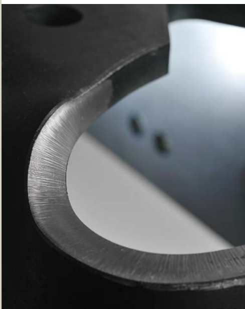
Trailer part made of 12 mm Armstrong® Ultra 700MC, laser cut and bent

industry.arcelormittal.com for thermo-mechanical grades industeel.arcelormittal.com for quenched and tempered grades